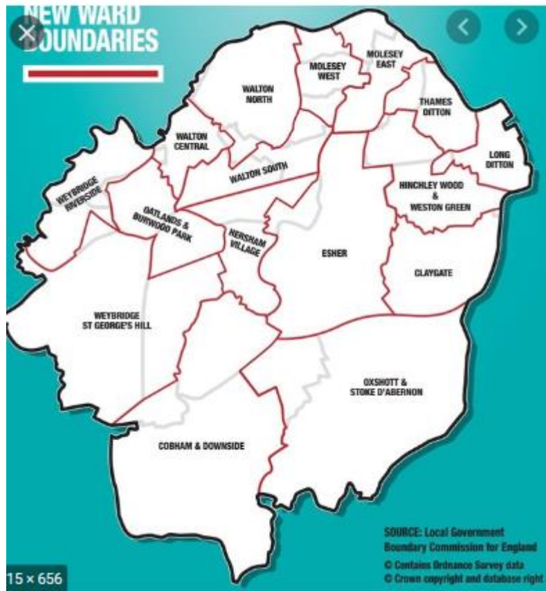
Map of wards in Elmbridge