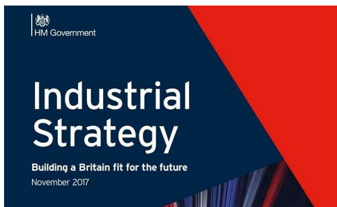
Our five foundations align to our vision for a transformed economy

The Government is trying to plan positively for the future with its Industrial Strategy setting out a long-term plan to boost the productivity and earning power of people throughout the UK.