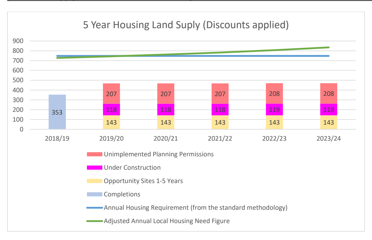
Figure 6: The Council's 5 Year Housing Land Supply