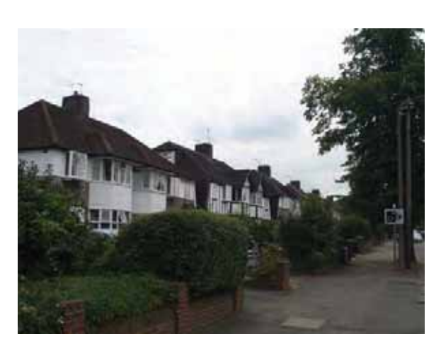
General view of houses, Hinchley Wood