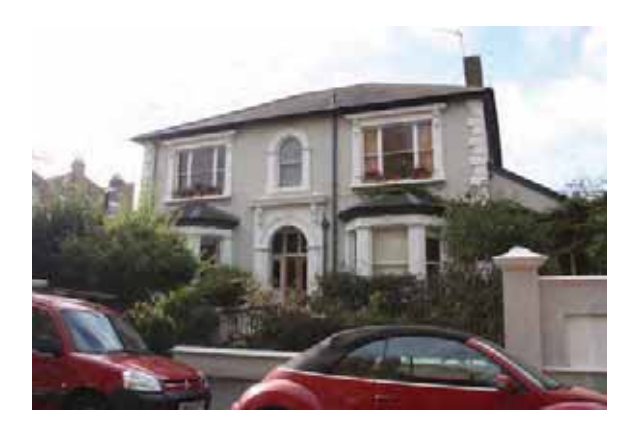
Victorian Villa, Palace Road, Kent Town

2.12 Through the 19th century, the brick and stucco Victorian villa type, usually with a natural slate roof rather than the more vernacular clay tile is seen in numbers in Kent Town, East Molesey. It is also apparent in parts of Thames Ditton , most notably fronting Giggs Hill Green, but is limited to isolated examples or small groups. This was followed in the late 19th century and early years of the 20th century by the style which is commonly regarded as part of the Arts and Crafts movement. There are some fine examples within Elmbridge which reflect the quality and architectural features which are characteristic of the style.