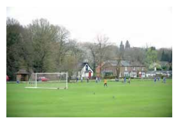
West End Green, Esher

2.22 Schools often have extensive playing fields. Recreation grounds generally have public access and often form pedestrian routes to and through residential areas. These green corridors are important to the permeability of residential areas and the amenity of local people using these spaces for recreation, dog-walking and alternative pedestrian routes to busy roadways.