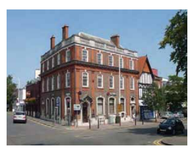
Queen Anne Revival style, NatWest Bank, Esher

The most widespread building type 2.11 across the Borough is the large semi-detached and detached house. There are some 18th century houses spread across the Borough but generally, apart from modern neo-Georgian pastiche, and some of the Queen Anne Revival examples of the late 19th century, Elmbridge does not have a strong 18th century building tradition which defines any particular area.