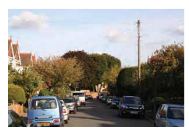
Ashley Road, Thames Ditton - private gardens contribute to the quality of the public realm