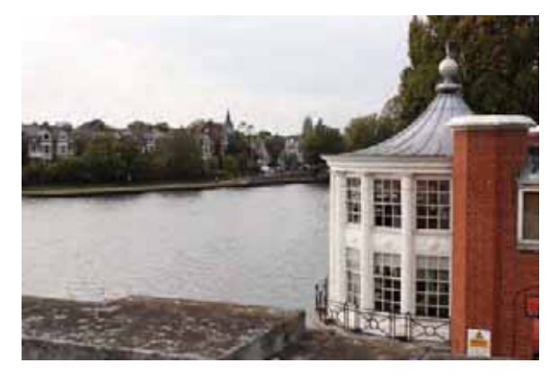
Thames Riverside from Hampton Court Bridge

1.3 Historically, the area was limited to very localised areas of dispersed settlement; Weybridge, Walton, Esher, Thames Ditton