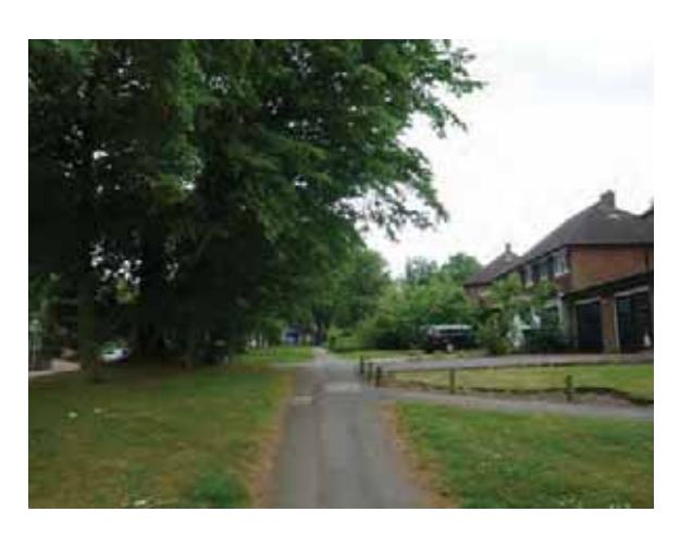
Wide grass verges and mature trees to Oaken Lane, Claygate

2.28 The third type is the street tree, which includes a wide variety of species and sizes, and form an important part of the public realm. Good examples are found within Claygate and Weston Green .