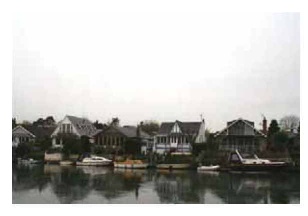
View of the south bank of the River Thames north of Thames Ditton

2.31 Development adjacent to the rivers reflects geographical constraints such as flooding and there are a number of areas of open space The river edge is generally understated and has not been subject to significant development. Islands and adjacent banks often have chalet style houses with rooms in the roof. Elsewhere there are two storey boathouses, occasional public houses to the waterfront and industrial buildings, low key residential estates and more modern wharf side developments. The scale is mostly very modest. This, together with the diversity of design, forms an important characteristic of this part of the Borough. In addition a high degree of architectural quality is seen in the remodelling and alteration of properties to the riverside.