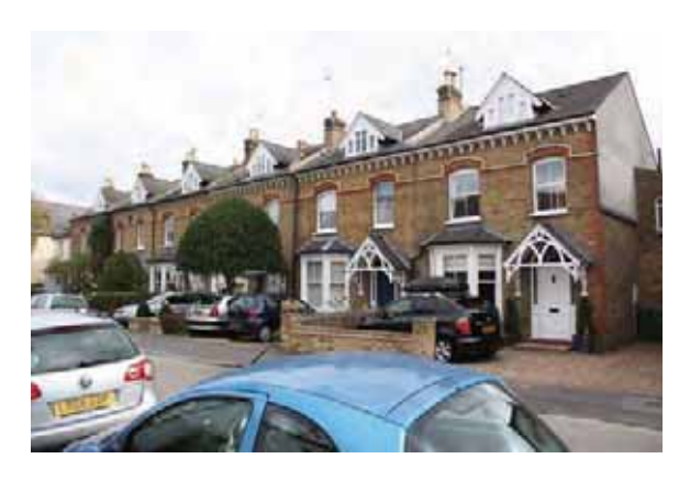
Late 19th houses to Manor Road, Kent Town

This is well represented to the immediate north and east of Walton on Thames town centre and to the north of Thames Ditton village and parts of East Molesey .