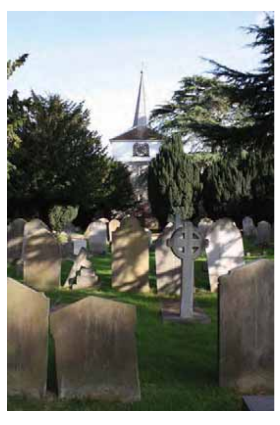
Early 13th century tower of St Nicholas Church, Thames Ditton

Much of the early settlement within the Borough of Elmbridge could be considered as nucleated, meaning they formed into individual communities with a central core. Many settlements grew up at a crossing point to the river(s) such as Weybridge, Walton on Thames and East Molesey or at an important junction of roads (Esher and Cobham). The church is generally the oldest surviving building and is sometimes linked to a former Manor House (Walton on Thames for example). None of the settlements had significant markets, although no doubt trading occurred at these nodal points. There would have been accommodation for travellers, which in places developed into far more significant inns and staging posts in the late 17th and 18th centuries. This is particularly the case for Esher and Cobham, both on the London-Portsmouth Road. Between these nucleated settlements was common and heathland with scattered farms and hamlets. Hatchford (Cobham) and historic Stoke D'Abernon are good examples of these.