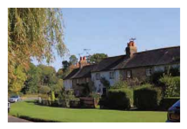
Tinman's Cottages, Downside

In the south of the Borough, the 'rural vernacular' displays a more locally distinctive use of materials and building type. Most of these buildings are either small country houses, large farmhouses (some of which probably originated as Manor houses), associated farm groups (barns, stables and outbuildings) and finally cottages set in dispersed groups.