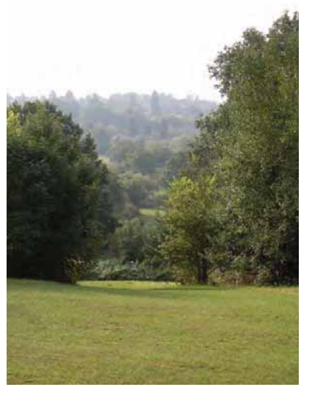
View from Telegraph Hill, Claygate

The Borough's landscape provides the setting for a number of key strategic views and landmarks. (5) Given the generally low lying nature of the Borough, and the extensive tree cover within and beyond its boundaries, potential views are often foreshortened by tree enclosure or changes in topographical levels combined with woodland. There are however, a series of ridges which give rise to open views either to the north; notably from Oatlands Park Hotel, Weybridge and to the north of Esher on dropping down across Sandown racecourse; to the south from Telegraph Hill across Claygate; and from Oxshott Heath across Oxshott. These views are characterised by their tree dominance.