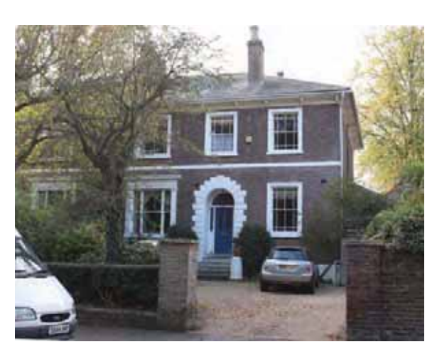
Semi-detached villa, Kent Town, East Molesey

1.5 In terms of built form, there are three broad areas of character transition across the Borough. These are illustrated in Map CO1. The north-east of the Borough has a strong sense of a London suburban character, particularly around the Hampton Court Bridge area of East Molesey, for example Kent Town with its London brick villas and ragstone church. This is also apparent in parts of Thames Ditton and Long Ditton, Hinchley Wood and some the more modest estates of West Molesey.