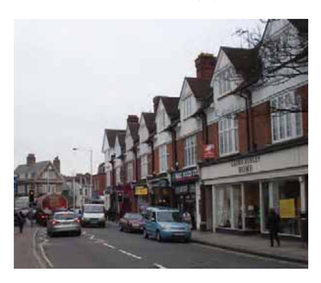
Weybridge Town Centre

2.17 The Vernacular Revival style of the early part of the 20th century is characteristic of some of the Borough's town centres, particularly Weybridge and Cobham , and to some extent, Esher . Here, half-timbering is a strong characteristic of the upper floors, usually applied to a series of gables. The projecting oriel window is a common feature to these commercial building types.