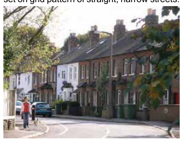
Angel Road, Thames Ditton

This is well represented to the immediate north and east of Walton on Thames town centre and to the north of Thames Ditton village and parts of East Molesey .