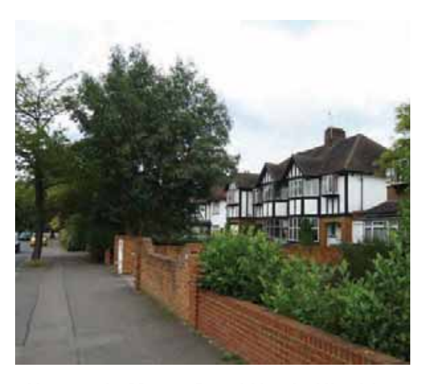
Houses in Manor Road North, Hinchley Wood

2.16 This style has permeated through all subsequent periods of development across the Borough. Often referred to as 'Stockbroker Tudor', it became the preferred style of the speculative builders of the 1920s and 30s. Clive Road, Esher, is a good example with a notable attention to detailing. Later versions, for example the housing at Hinchley Wood has some of the elements of this style.