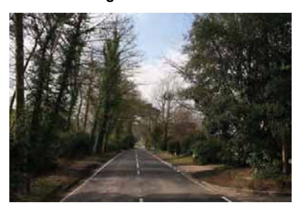
The semi-rural enclosed character of Leigh Hill Road, Fairmile