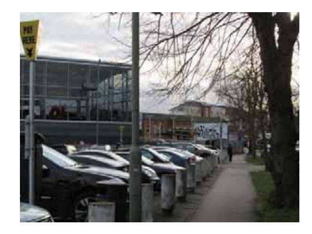
Station Avenue, Walton on Thames