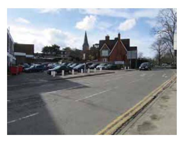
View to Christ Church, Esher

2.34 Short views, and local townscape views, often revolve around the notable church spires at Weybridge , Esher , Walton , East Molesey (Kent Town) and Thames Ditton . These are often glimpsed, rather than full views and often seen over buildings, particularly in relation to roofs. These views are sensitive to change especially where the proposed roofscape is likely to impact on views to an important heritage asset.