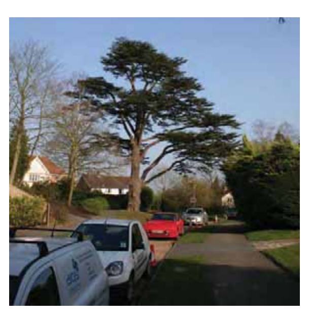
Cedar of Lebanon to front garden, Fernhill, Oxshott

1.5 In terms of built form, there are three broad areas of character transition across the Borough. These are illustrated in Map CO1. The north-east of the Borough has a strong sense of a London suburban character, particularly around the Hampton Court Bridge area of East Molesey, for example Kent Town with its London brick villas and ragstone church. This is also apparent in parts of Thames Ditton and Long Ditton, Hinchley Wood and some the more modest estates of West Molesey.