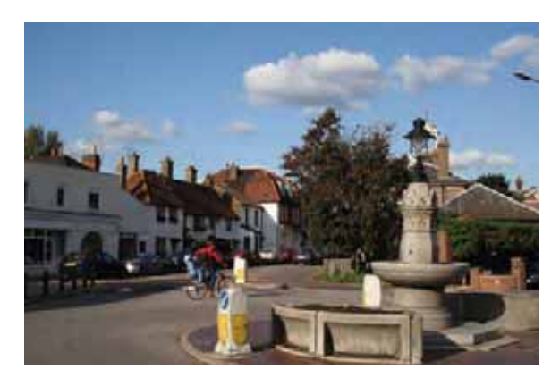
Old Village, Thames Ditton - a sense of the character of the older settlements

and Cobham related to the rivers and the principal routes to and from London passing through and crossing the rivers. Hampton Court Palace, located immediately to the north east of the Borough boundary, was also historically important. Outside these small dispersed settlements, the Borough comprised very large areas of common land, parks and hunting grounds associated with 18th century estates including Burwood Park; Claremont; Painshill; Oatlands; Cobham Park and Esher Place.