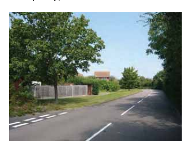
Rear garden fences 'front' Vanbrugh Drive

2.8 There is relatively little large-scale settlement development of the late 20th century. Hurst Park in West Molesey is a good example which does not follow the general trend of residential development characterised by a single 'spine' or through road. Instead, a series of short, curved cul-de-sacs are located off a secondary road. This layout can result in main roads being flanked by the rear garden fences of houses. Wellington Way ( Weybridge ) and Vanbrugh Drive ( Walton on Thames ) are examples of this layout type.