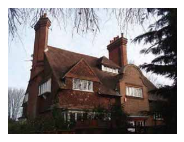
High end Domestic Revival, Oatlands Drive

1.6 The central belt of development, seen to run through the main settlement areas of Walton and Weybridge, and the estates of Cobham, has more of a Surrey influence with more reliance on the use of materials and Arts and Crafts inspired designs. These designs also feature in Claygate, although most of the area tends to take some form from its neighbours to the north and elements of material detailing from Surrey vernacular, with the exception of the Foley Estate area.