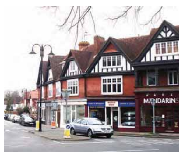
Corner of Church Street and Bridge Road; Arts and Crafts inspired commercial buildings

In the south of the Borough, the 'rural vernacular' displays a more locally distinctive use of materials and building type. Most of these buildings are either small country houses, large farmhouses (some of which probably originated as Manor houses), associated farm groups (barns, stables and outbuildings) and finally cottages set in dispersed groups.