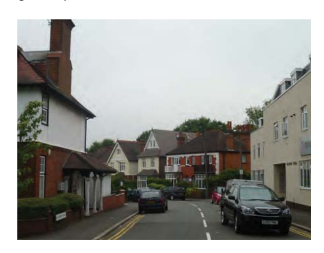
Edwardian houses to Hillbrow Road