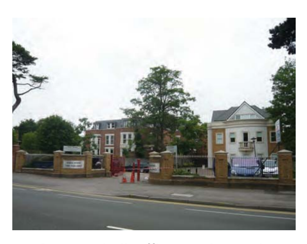
Purpose built offices to the north Portsmouth Road