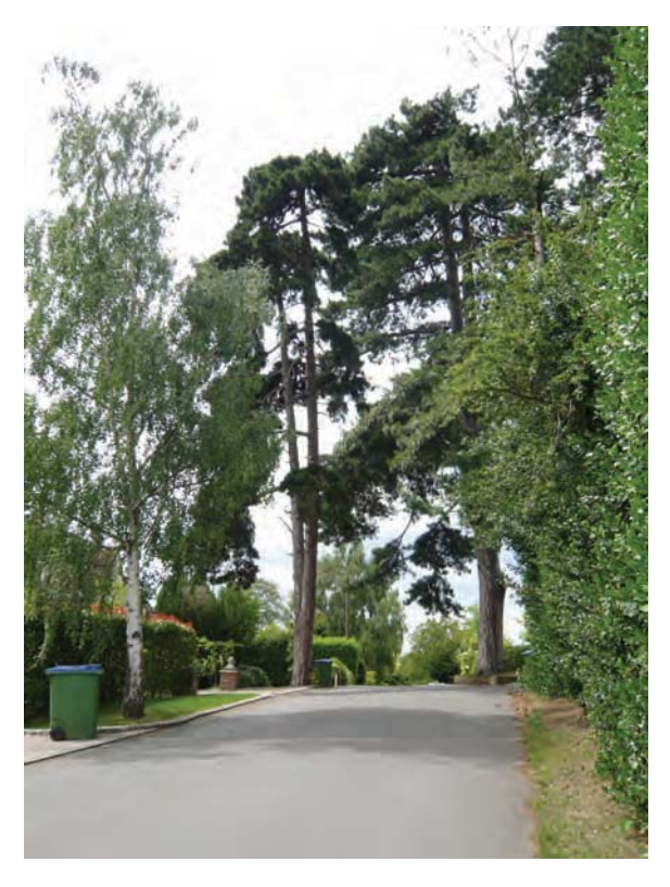
View looking north along Pelhams Walk