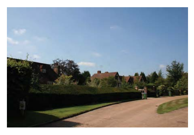
Houses to Clare Hill, high quality 20th century intervention into an 18th century landscape