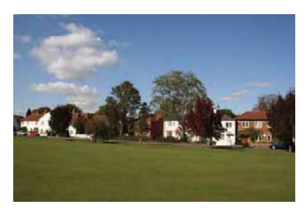
Views across Giggs Hill Green to houses on the north side