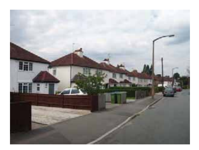
Loss of front gardens, Fleece Road

3.47 There has been some loss of front gardens to parking and this has started to change the character of some roads within this sub-area (parts of Fleece Road for example).