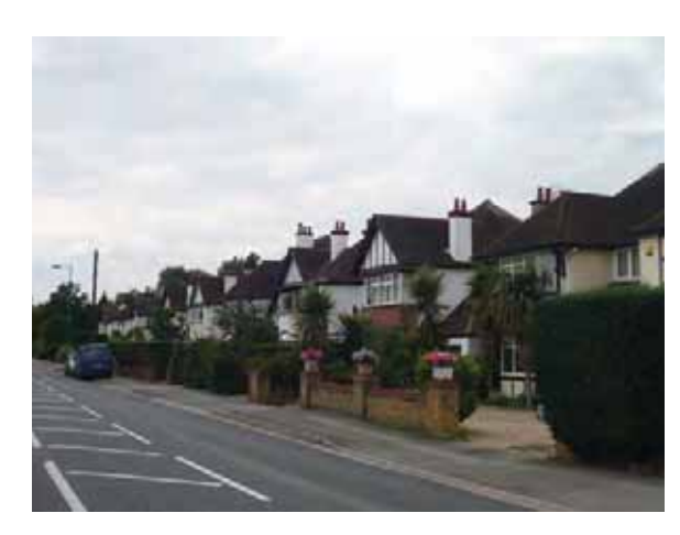
Houses to Ember Lane