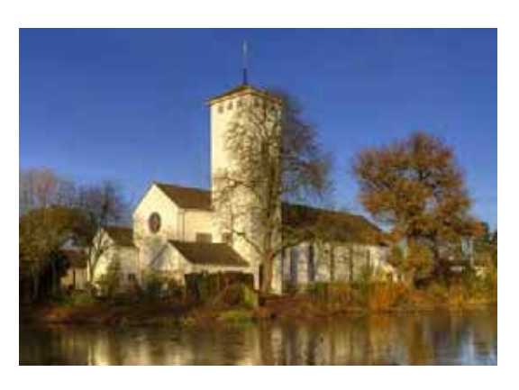
All Saints Church, Weston Green