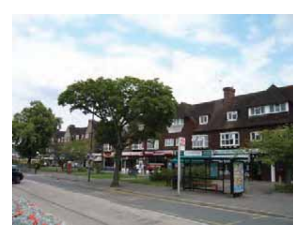
Hinchley Wood local centre - Manor Road North