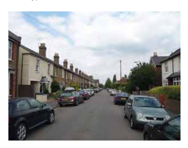
Houses to Alexandra Road

Road to the far eastern corner of the area and Claygate Lane to the south (adjacent to the railway).