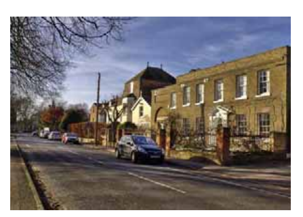
Groups of older houses, Weston Green Road

3.80 To the south of the sub area lies Weston Green Conservation Area. The main feature to the west of this area is Marneys Pond, overlooked by the Old Red House, an 18<sup>th</sup> century Manor House, the public house and All Saints Church, a local landmark.