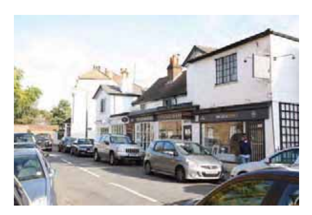
Mixed use to High Street, Thames Ditton

3.12 The mixed use nature of the sub-area; with residential, office, shops, cafés and restaurants is an important element of the character.