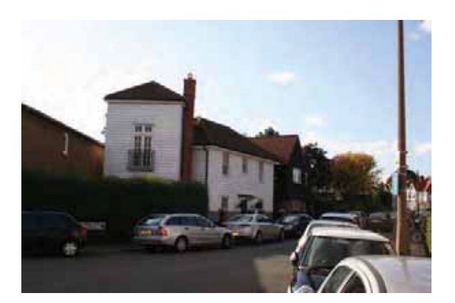
Houses at High Street and Ashley Road junction

3.8 There is a fine grain of development with the scale of built form being a mix of two or three storey buildings, some with shopfronts to the ground floor.