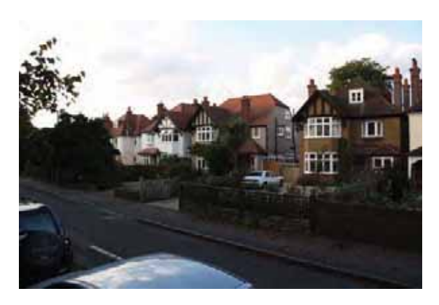
Houses to the north side of Station Road