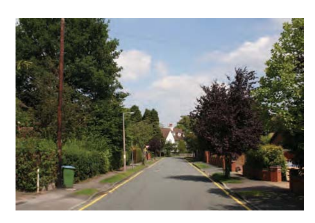
Trees to Woodside Avenue partially or fully obscure houses