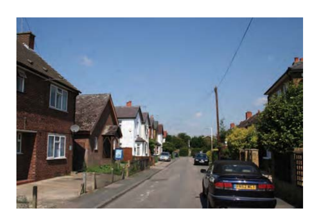
Snellings Road, looking north