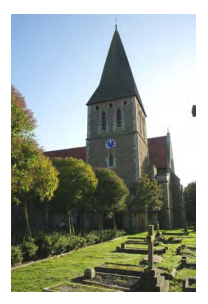
St Peters Church