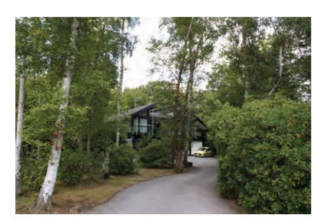
Houses set in semi-wooded plots