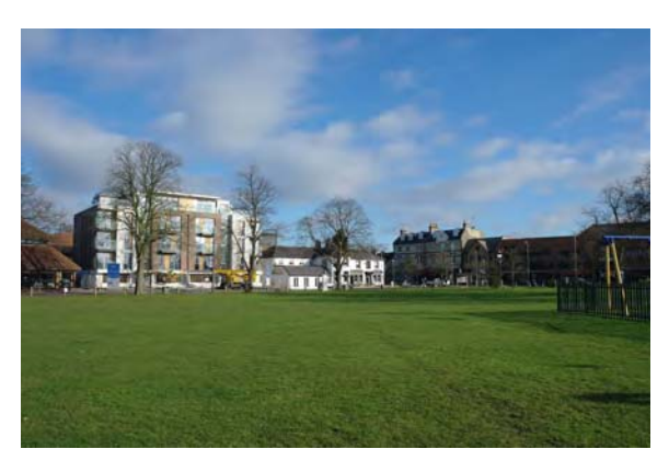
The Green, Hersham

3.10 The mix of uses and varied scale of buildings combined with this sequence of high quality open green spaces are perhaps the most defining features of this sub-area.