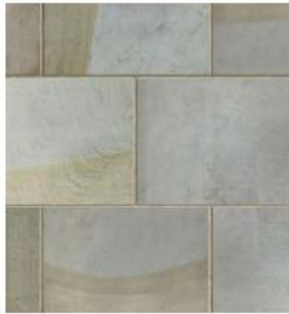
Scoutmoor Yorkstone 900, 800, 600, 400 x 600x50mm 450, 400, 300, 200 x 300 x 50mm