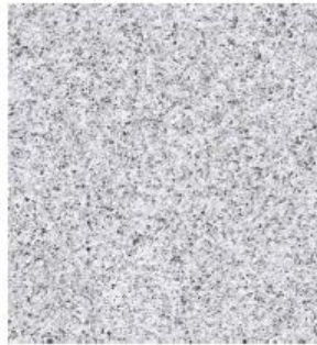
Silver Grey Granite Kerb Finish: Flamed