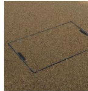
Recessed Manhole covers