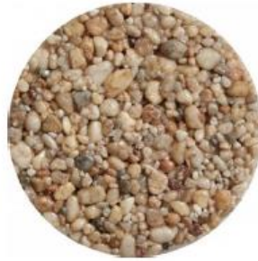
Resin Bound Gravel, natural aggregate Colour: Barley Beach