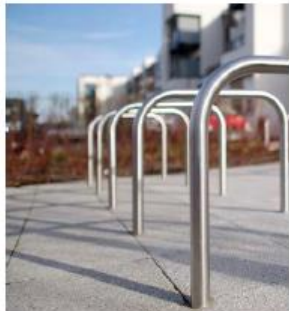
Sheffield Cycle Stands Brushed Stainless Steel