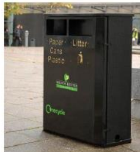
Derby Double Slimline recycling bin with Elbridge Livery