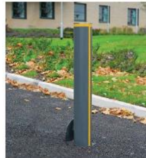
Removable Bollard Ashmore Steel bollard, powdercoated mild steel with reflective banding