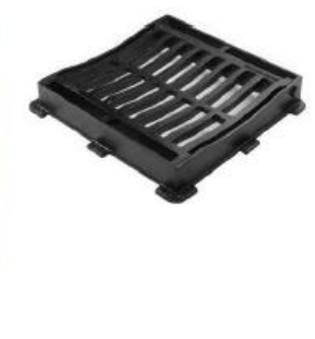
Dished Ductile Iron Drainage gully Grate