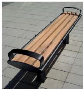
Zenith Bench Powder coated steel & hardwood timber