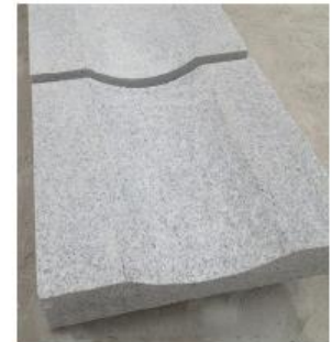
Dished Granite Drainage Channel. Silver Grey, Flamed